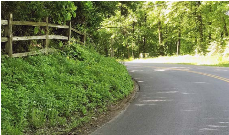
Above is the Maplewood Road curve facing south, the route walkers must take if abiding by pedestrian rules. This area is indicated by red circles on the maps below. A retaining wall will create a 5-foot setback to increase sight lines and provide walking space for pedestrians.

You may track your absentee ballot at MNVotes.org from the time it leaves your hands until it is counted.