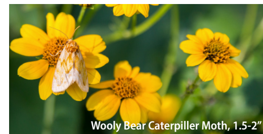
Woolly Bear Caterpillar Moth, 1.5-2"

These fuzzy pollinators come in diverse colors, shapes, and sizes – from weird to wonderful. There are more than 11,000 species of moths in the U.S. – that's more than all bird and mammal species combined. Comprising a good share of the bottom of the food chain, caterpillars and moths are important food sources for birds and, in some parts of the world, people.