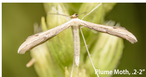
Plume Moth, .2-2"

These fuzzy pollinators come in diverse colors, shapes, and sizes – from weird to wonderful. There are more than 11,000 species of moths in the U.S. – that's more than all bird and mammal species combined. Comprising a good share of the bottom of the food chain, caterpillars and moths are important food sources for birds and, in some parts of the world, people.