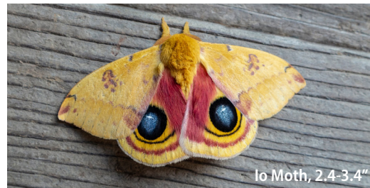
Io Moth, 2.4-3.4"

Spring garden clean-up, if done too early, can be devastating for some of Minnesota's most spectacular moths. To increase chances of welcoming these beauties to your landscape, wait until nights as well as days are consistently above 50 degrees for a week or more.