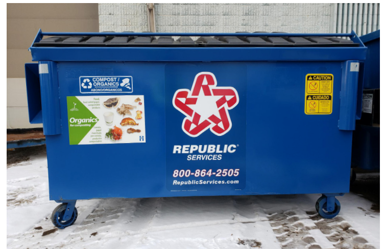
An organics recycling drop-off bin is being installed near City Hall.