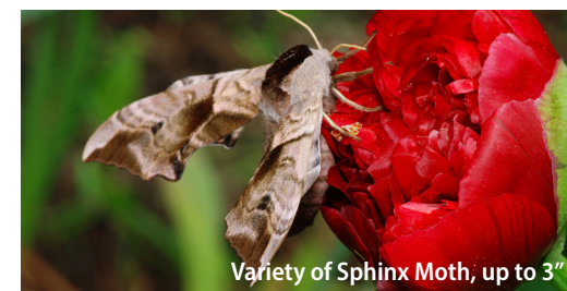
Variety of Sphinx Moth, up to 3"

Many moths are nocturnal and attracted to light, which is causing their numbers to decline as they become visible to predators. Light pollution is creating swaths of habitat now void of many species.