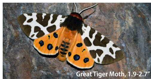
Great Tiger Moth, 1.9-2.7"

Many moths are nocturnal and attracted to light, which is causing their numbers to decline as they become visible to predators. Light pollution is creating swaths of habitat now void of many species.