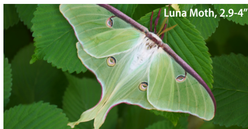
Luna Moth, 2.9-4"

With spring on its way, watch for the arrival of pollinators. In the meantime, you can be amazed by photographs of nearly 400 varieties of Minnesota moths at butterflyidentification.com .