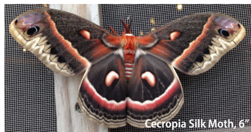
Cecropia Silk Moth, 6"

Spring garden clean-up, if done too early, can be devastating for some of Minnesota's most spectacular moths. To increase chances of welcoming these beauties to your landscape, wait until nights as well as days are consistently above 50 degrees for a week or more.