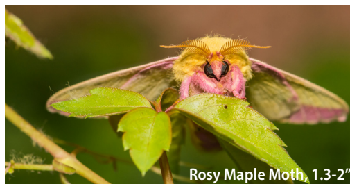
Rosy Maple Moth, 1.3-2"