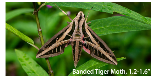
Banded Tiger Moth, 1.2-1.6"

As with most wildlife, leave them alone and they will leave you alone. If you do have an issue, contact the Deephaven Police Department at 952-474-7555.