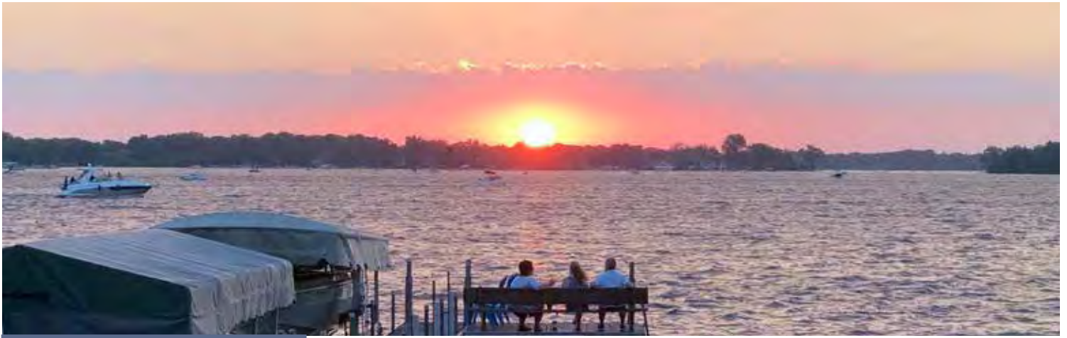
Late summer sunset.